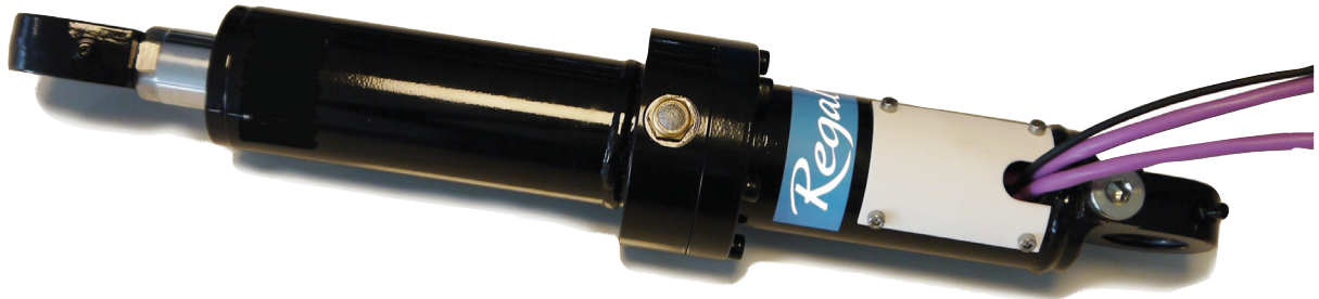
RCP with GYSE-P (Profibus-sensor)

Regasense® is a trademark of Regal for position sensors. The RCP sensor is one of these.